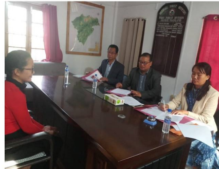
RECRUITMENT OF SUPPORT STAFF