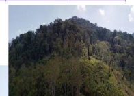
OLD NKIO VILLAGE