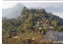
MPAI NAMCI VILLAGE