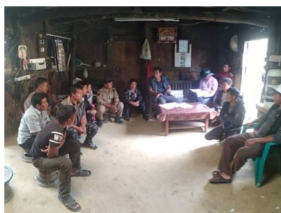
JFMC FORMATION & REGISTRATION MPAI NAMCI