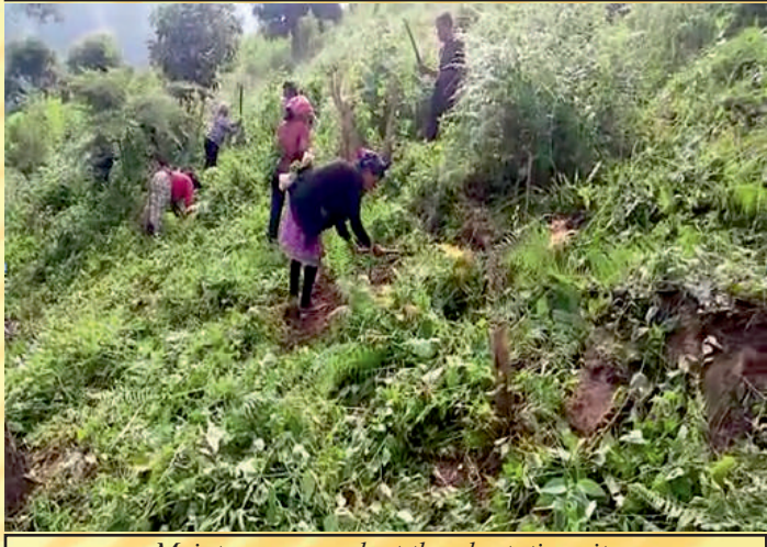
Maintenance work at the plantation site