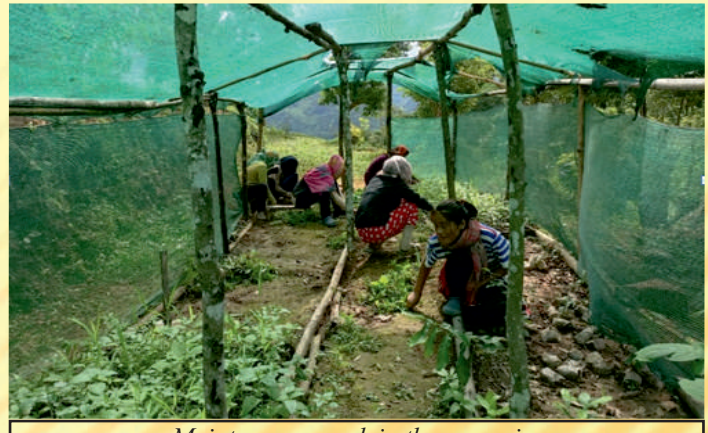
Maintenance work in the nurseries