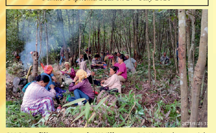
SHG Profiling at Batch-II Villages: DMU 1 along with FNGO Team Dimapur visited Piphema Old Village and Pherima A Village (both Batch II under Piphema Beat) for SHG Profiling. During the Profiling 13 SHGs were profiled i.e. 3 SHGs at Piphema Old Village and 10 SHGs at Pherima A village.