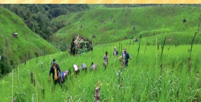
Old Nzau Village