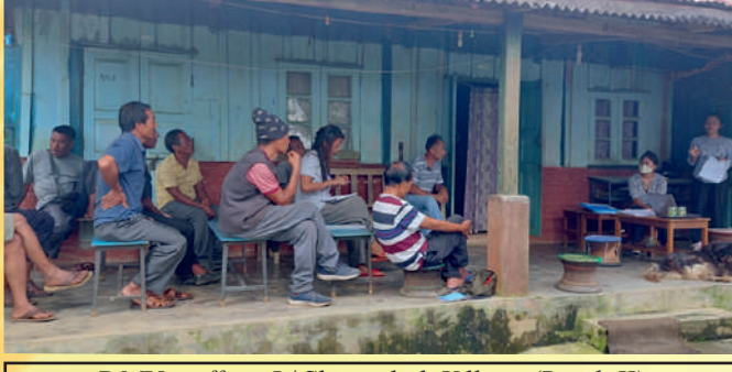
DMU staffs at L/ Sheanghah Village (Batch II)

JFMC Wanching Village (FMU Naginimora) during the month of September has completed plantation activities at JFF, JCF & JCC site as reported by FMU staffs.