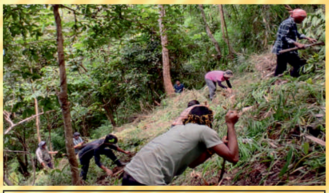
Mon Village PEC plantation work.