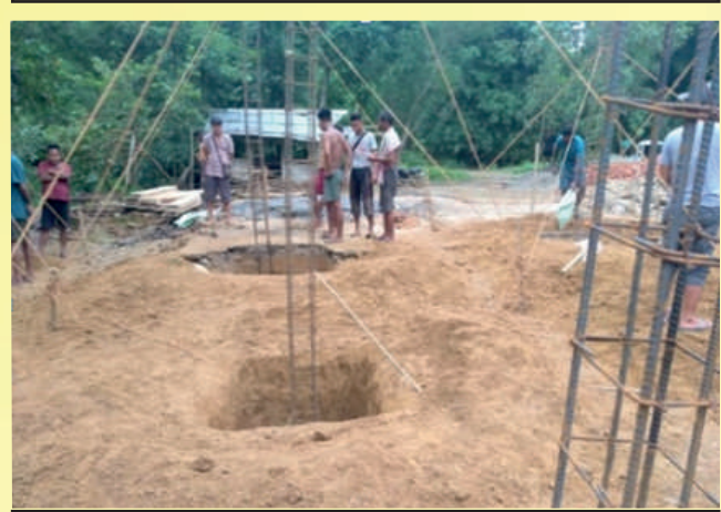
Sitap Village (Batch-II) EPA - Community Hall under construction as on 22<sup>nd</sup> August 2021.