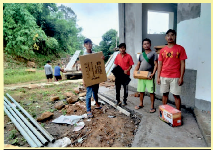
Solar Light delivery at Piphema Old Village.

Refresher Training on Web GIS and Mobile Application: The training was conducted at Forest Office Complex Dimapur from 14<sup>th</sup>-16<sup>th</sup> September 2021 for three divisions i.e. Dimapur, Peren and Mon. The trainees visited Piphema Old Village for hands on training of mobile application and the exercise was conducted at JAF Model after which PRA exercise with the JFMC members of Piphema old Village was conducted.