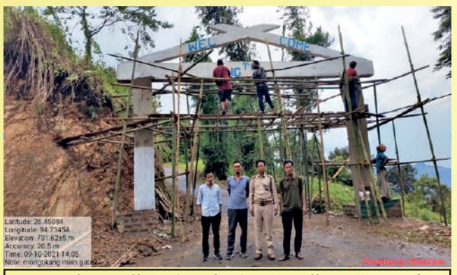
Mongtikang village (Batch-II) EPA- Village Gate under construction as on 22<sup>nd</sup> August 2021.