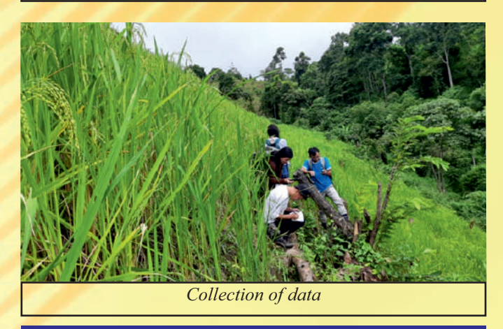
Activities undertaken in various District Management Units