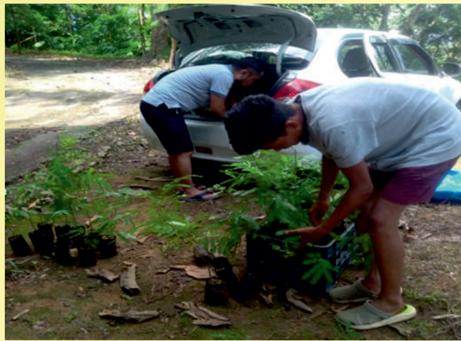
Plantation: Plantation in model areas, Nursery activity, PEC site clearance of brushwood/weed, site clearance and path maintenance work at WHS were started from 6<sup>th</sup> August and completed on 21<sup>st</sup> August 2021, at Longmisa village batch-II with the involvement of FMU head Mokokchung and staffs along with the JFMC members and villagers.