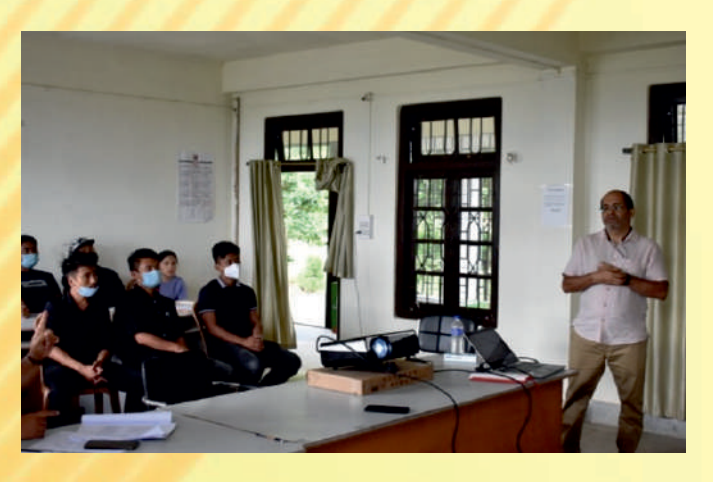
Saplings distribution: On 5<sup>th</sup> August 2021, Saplings were distributed from the Sungratsu JFMC nursery to NSRLM Mokokchung.

Training on Baseline Survey: From 2<sup>nd</sup> to 3<sup>rd</sup> August 2021, the FMU head Mokokchung range along with the Staffs attended the follow up training on Baseline Survey for FNGO with Shri.Shailesh Nagar, M & E expert (PMC) as the resource person.