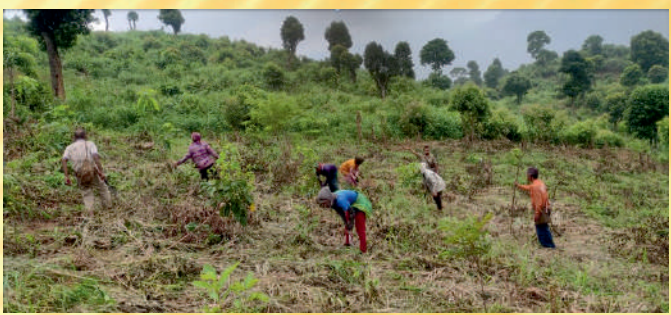
JFMC Old Riphyim village started maintenance works at the JFF model site under Forestry interventions.

Hands On Training on Accounting Procedure to JFMC's of Both Batch I & II: On 23<sup>rd</sup> September 2021 a hands on training on JFMC accounting procedure was conducted in the office premises of the Divisional Forest Officer cum DMU Head Wokha. The training was attended by the Presidents & Treasurers of both Batch-I & II villages, FMU Head Wokha Range, FNGOs and the DMU support staff.