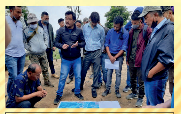
PRA Map Exercise at Zhadima 'A'