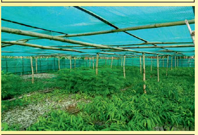
Wakching Village Nursery