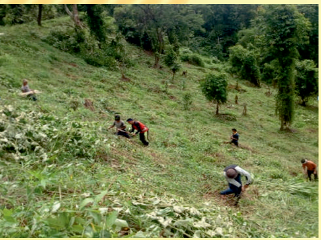
Plantation activities were carried out at JFF site Hukphang Village (Batch-I).