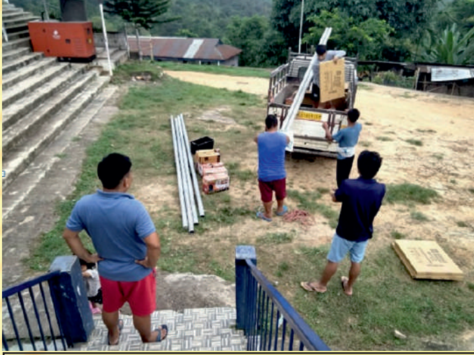
Solar Light delivery at Pherima A Village.