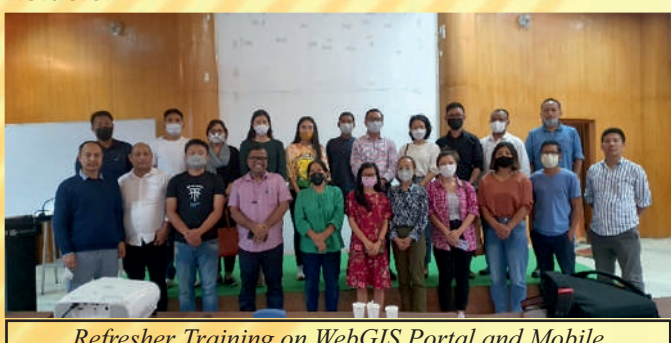
Refresher Training on WebGIS Portal and Mobile Application

Need Assessment data analysis and interference for designing effective training programs. The training also highlighted the finalization of training courses design based on draft prepared by PMC. It was also conducted for preparation of training modules for JFMC members, SHG members and other stake holders.