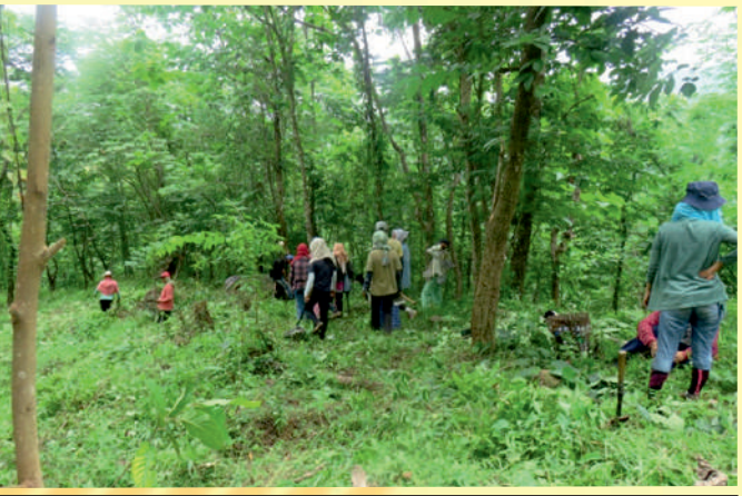
P<mark>lantation Activity at JCF Mo</mark>del, Thekrejuma Village Batch I under Piphema Beat on 27<sup>th</sup> July 2021