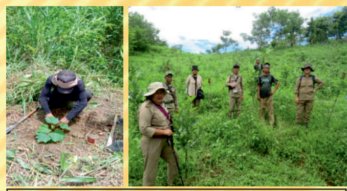
Gap replacement at JAF, JFF and PEC area in Mopungchuket.