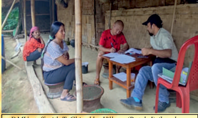
DMU staff with T. Chingkho Village (Batch-I) (hands-on training with JFMC EC on Record keeping)