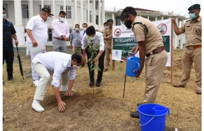
Chief Minister Shri. Neiphiu Rio planting a Tree in Celebration of World Environment day on 5 th June, 2021 at Dimapur.