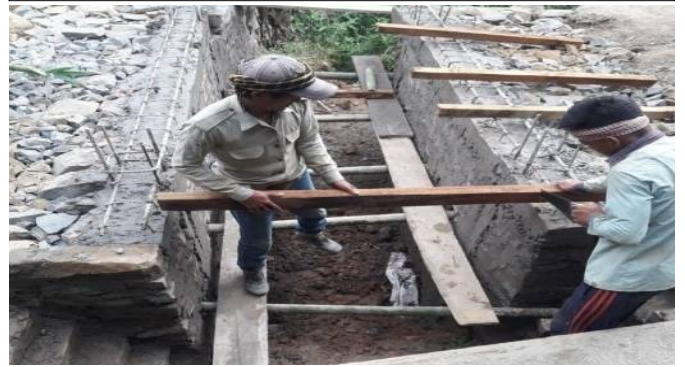
Salulamang EPA & WHS