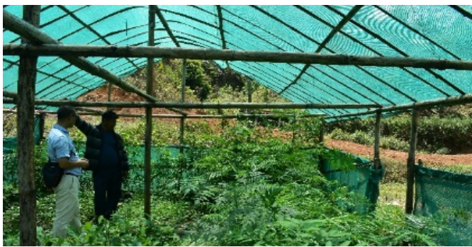
Pherima 'A' Village