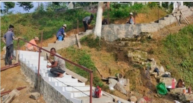
Merangkong EPA Footstep