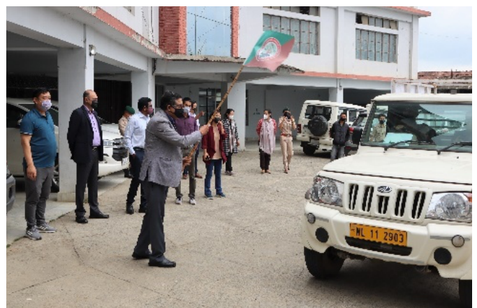
CPD flagging off the Distribution of Seedlings to all the Legislators & HODs.