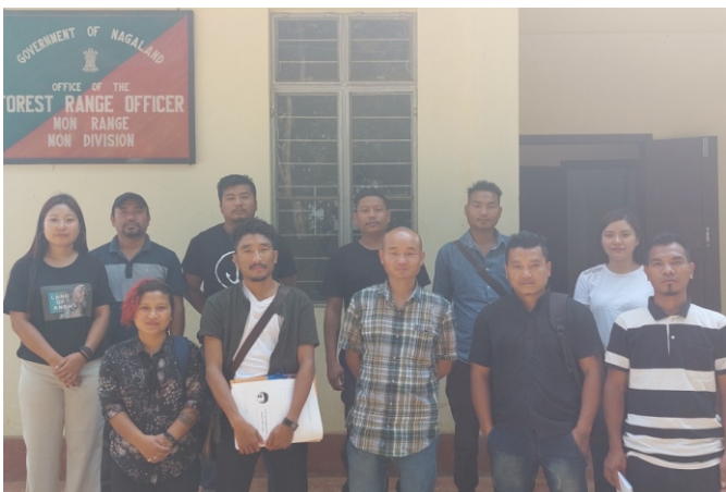
FNGO- Konyak Tribal Welfare Society at Mon