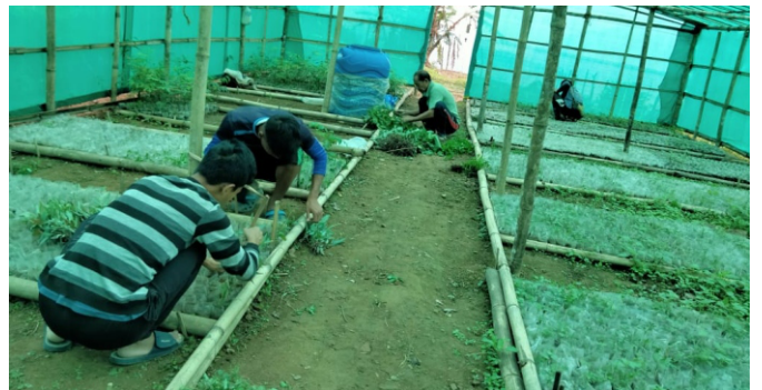
Piphema Old Village