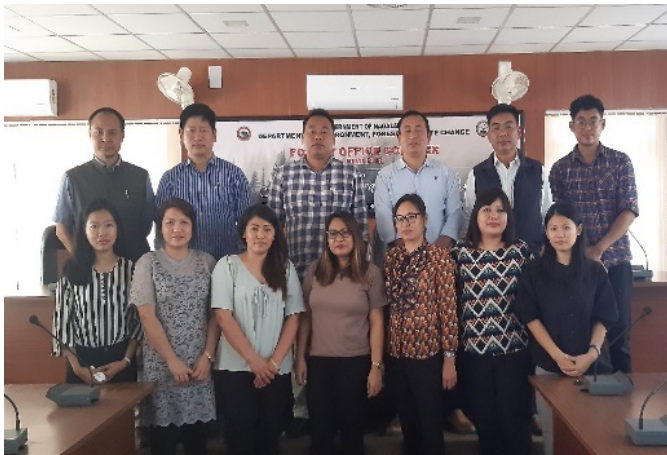
DMU Head Dimapur along with the FNGO Youthnet (Dimapur).