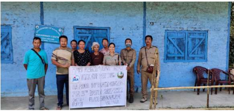
FMU Head and staff with the Village leaders and elders of Ruzaphema Village and SirhiAngami Village (Batch-III) under Medziphema Beat. Dimapur.