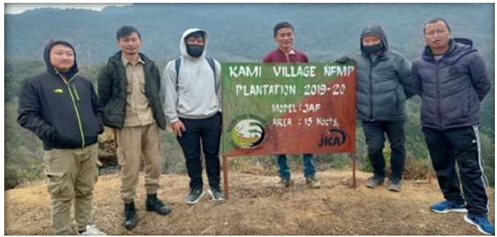
FMU Head Pfutsero along with DMU support staffs, FMU staffs and FNGO during the GIS data collection exercise at kami village