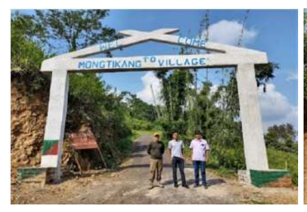
EPA (Village Gate) of Mongtikang village (Completed)