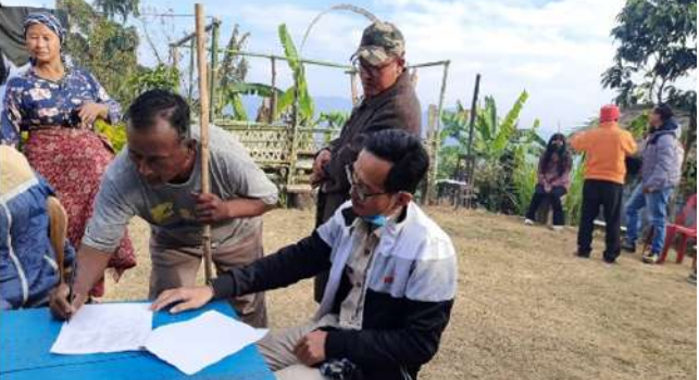
Tsosinyu Village Council member signing the PIC form.