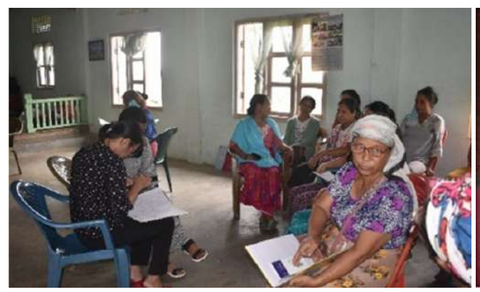
Dimapur: DMU staffs interacting with the Medziphema SHG members for collection of Data for MIS Portal.