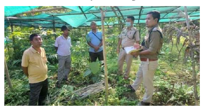
Asst. DMU & FMU Head Interaction with JFMC & Nursery inspection at Tuimei Village