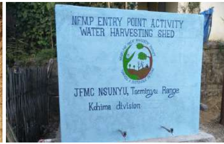
WHS of Nsunyu Village (Batch-I)