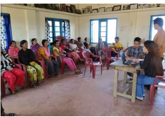
Discussion on business plan for IGA with the SHGs at Noksen village, under FMU Tuensang on 13th Oct2021