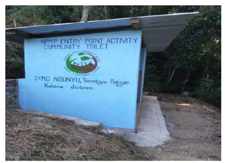
EPA - Community Toilet of Nsunyu Village (Batch-I)