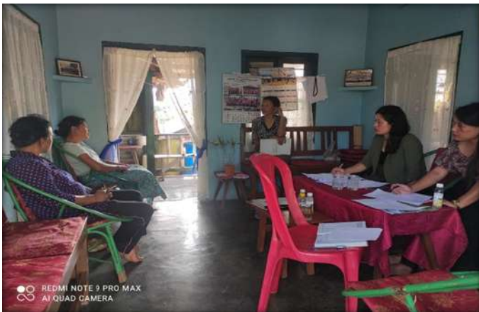
Wokha: FNGO Preparing Business Plan with the SHGs