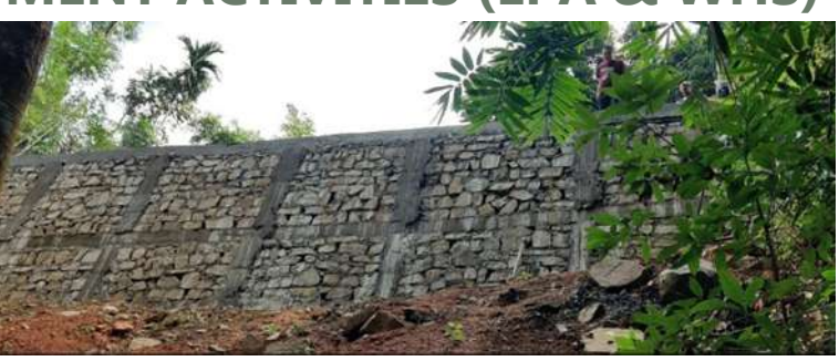
Retaining Wall renovation works at Medziphema Village (Completed)