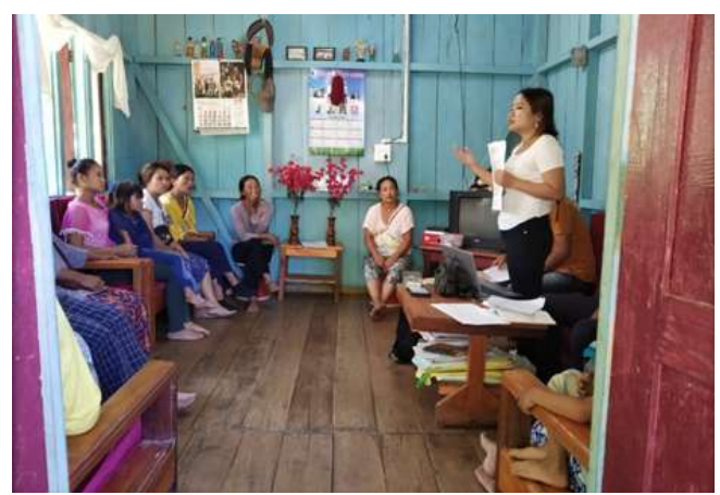
Discussion on business plan for IGA with the SHGs at Chimonger village, under FMU Longkhim on 12<sup>th</sup> Oct. 2021