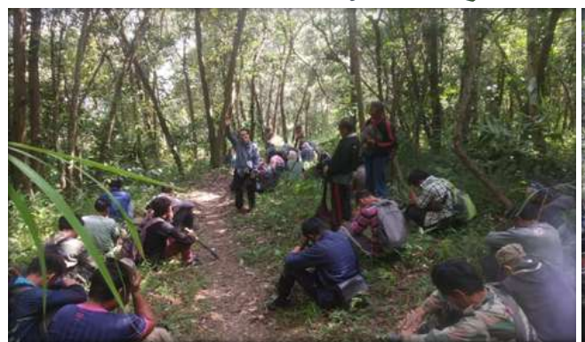
JFMC Chairman conducting a short prayer before the start of maintenance work at JAF Model Lephori Village.