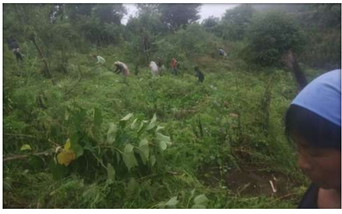
Maintenance work at JFF Model plantation site Kami Village.