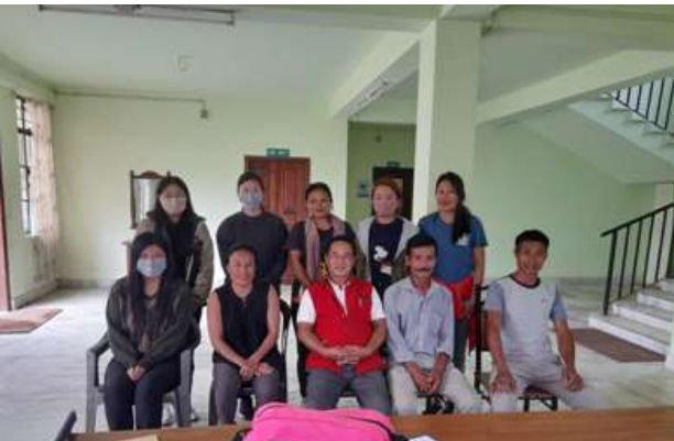
DMU Support Staffs, JFMC, SHG members & Community Mobilizer at Zhadima 'A' village.