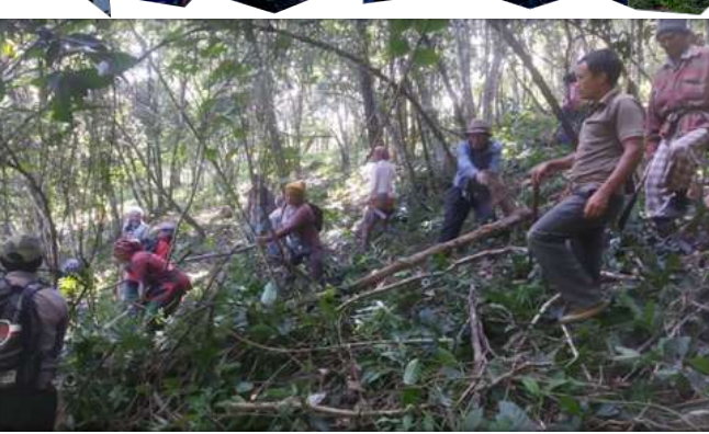
Maintenance work at JFF Model plantation site Lephori Village.