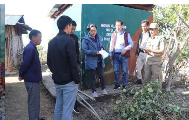
Dy.P D inspecting the Water Harvesting Structure (WHS) at Hukphangvillage