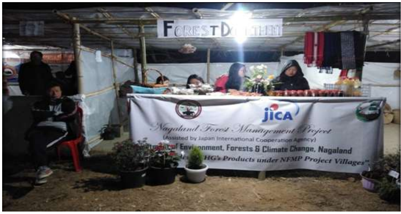
Wokha: SHG members of New Riphyim, Old Riphyim and Wokha Village selling their products in a stall on 4th-7th Nov at Wokha local ground during the Lotha Tokhü Emong festival 2021.