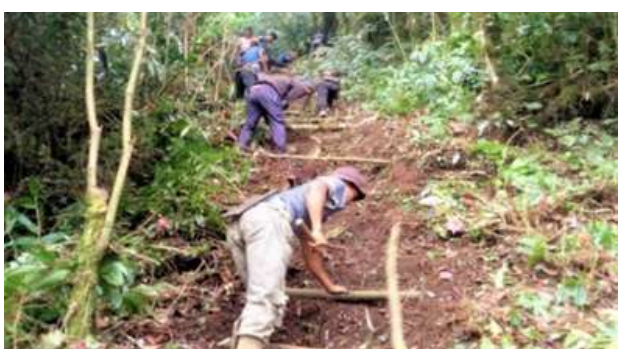
Hukphang villagers constructing Trekking Path at PEC Site.