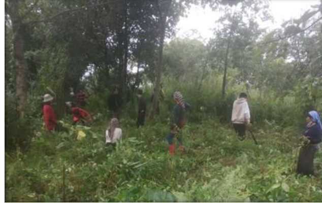
Community participation during maintenance of plantation sites at JCF Model Kami Village.

PHEK : During the month of October, maintenance of different Model plantations sites was done in both the villages of Batch-I (Lephori and Kami). Kami village under FMU Pfutsero undertook maintenance work at 3-Model sites for a total of 10 days with approx. 250 members taking part. The maintenance work was done in JFF, JCF and JCC model sites. Lephori village under FMU Meluri undertook maintenance work in JAF & JFF model sites with approx. 250 members taking part during the maintenance work spanning 2 weeks.