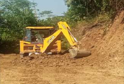
Peren Village: EPA -Broadening of village road.