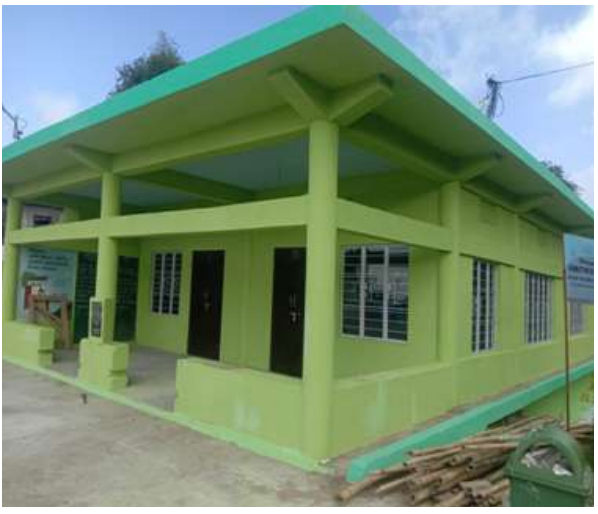
Community Hall Completed on 18th Oct, 2021 Changtongya New Village