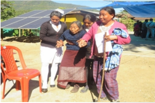
Nagaland Forest Management Project at Anatongre Village (Batch-I).

The event included general medical screenings, eye exams, dental, gynaecology, paediatrics, and other services. Several tests were also performed, including diabetic/sugar level, malaria, typhoid, HIV, Covid-19 and so on. All patients were given free medication. Around 200 people were screened and treated as a result of this. In addition, an enrolment drive for CMHIS and Ayushman Bharat was carried out. The nearby villages were also invited. Over 30 members of the medical department were involved in this programme.