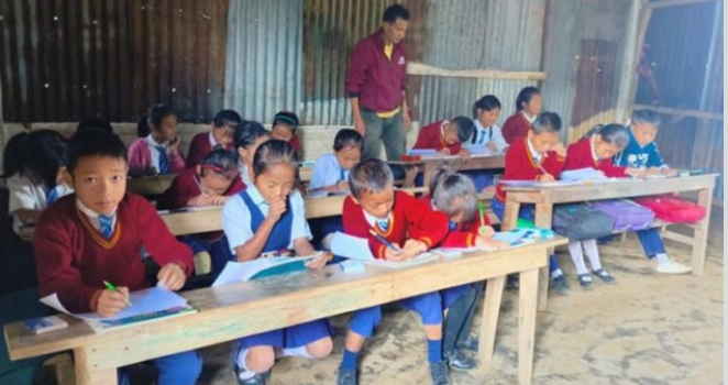
Students at the painting competition.