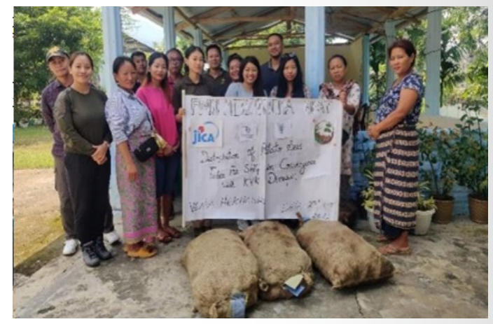
SHG members of Piphema Old Village (Batch-II) & Hekheshe Village (Batch I) Under Piphema Beat along with the FNGO Team after distribution of Potato Seed Tubers.