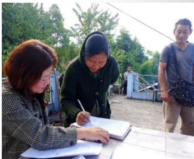
Signing of SHGs loan agreement was successfully done with Yanchanchi, Mhanka & Myanta SHGs of New Wokha Village.

Release of SHG Revolving Fund under Peren Range: On 16<sup>th</sup> Dec 2022 FMU Head Peren released the Revolving Fund after signing of loan agreement and cheques were handed over to all the six SHGs of Peletkie and Peren JFMCs in the presence of respective JFMCs under Peren Range.