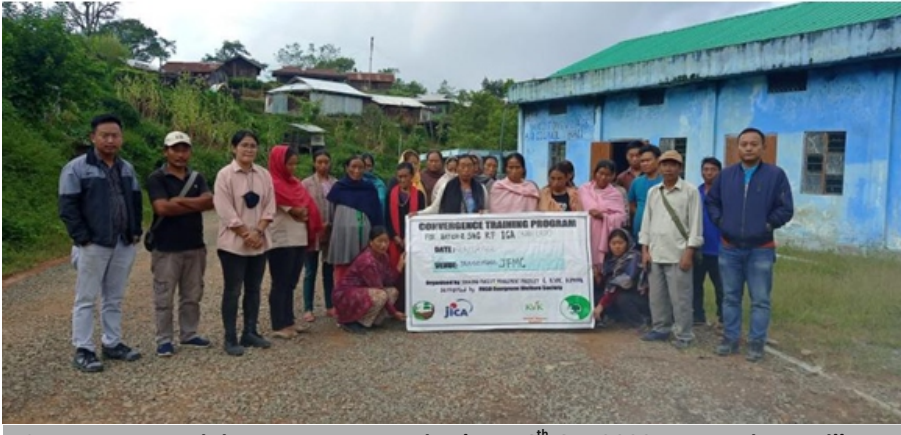
Convergence training program organised on 16<sup>th</sup> Oct 2022 at Yangzitong village.

The Nagaland Forest Management Project (NFMP) was implemented at Merangkong Village in the year 2020. One of itsmain objectives is Forestry Intervention and Biodiversity though Community