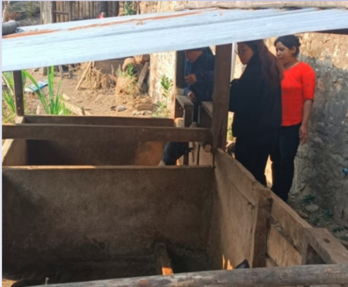
Beneficiaries receives piglet under Tata AIG CSR Project