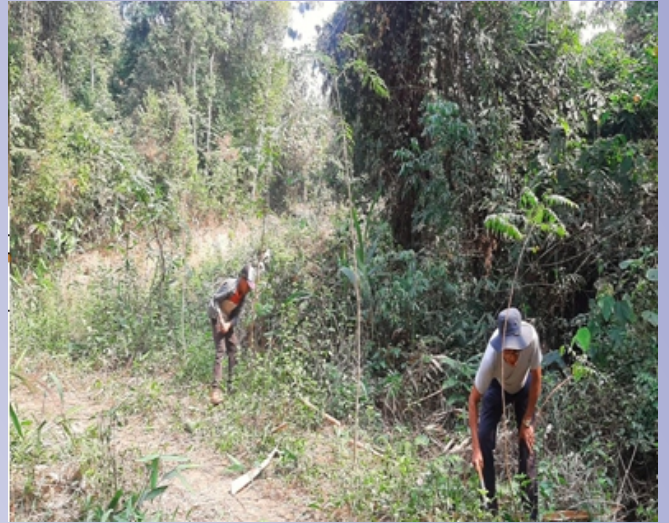
PEC model site at Changtongya New village on 26 th Jan. 2023