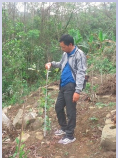
DMU Staff measuring the plant sapling at JAF model New Wokha Village (Batch-II)