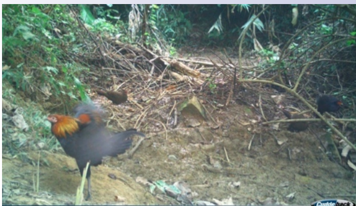
FMU staff along with JFMC members retrieved the camera traps that were installed at JCC and PEC model area at Sungratsu village