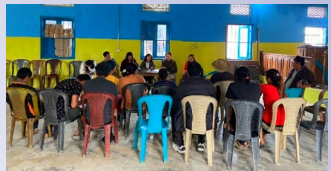
Elumyo Village council members at the signing of FPIC on 15 th March 2023