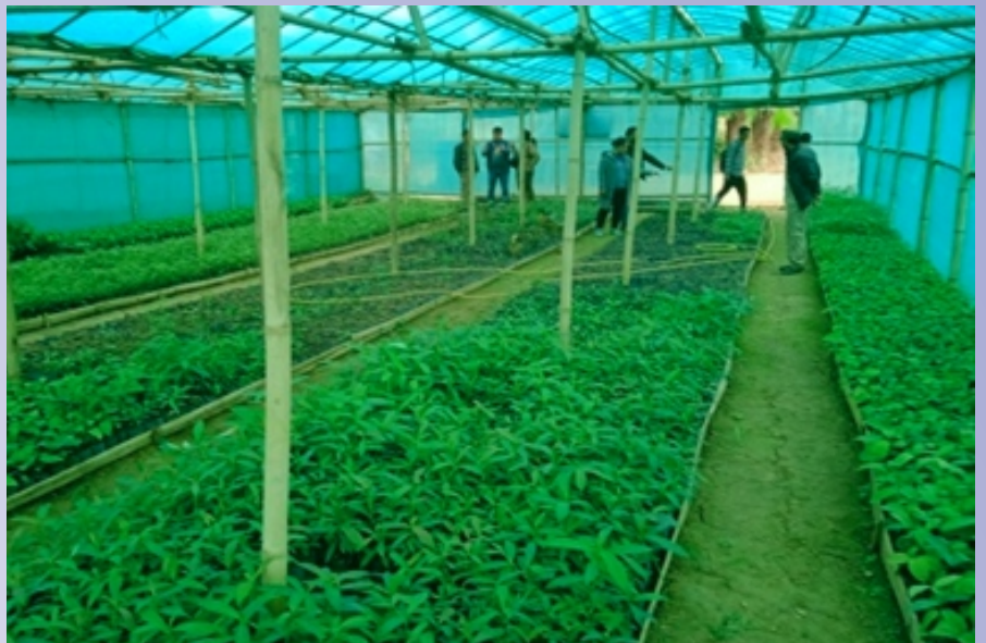
Chungtia Village Nursery