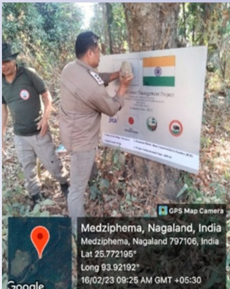
FMU Field staff putting up NFMP Model board at JCF Model Pherima A village (Batch-II)