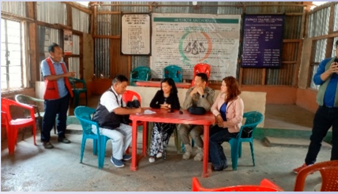
Mungya Village council members at the signing of FPIC on 23 rd March 2023