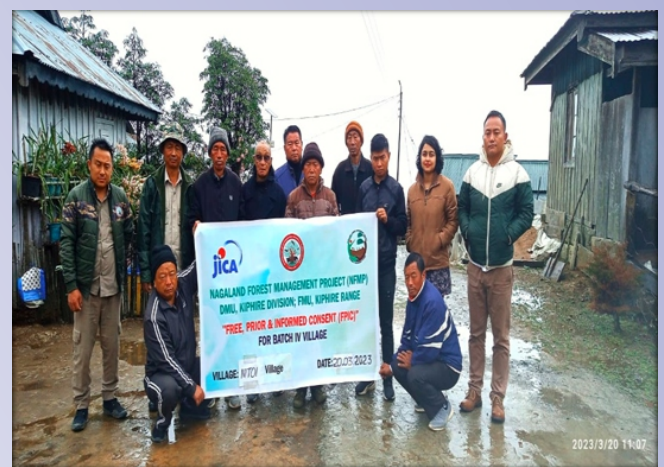
Nitoi Village council members with officials of DMU Kiphire after signing the FPIC

DMU Kiphire: Meeting for taking Free & Prior Informed Consent (FPIC) was conducted in two villages namely Thsingar village & Langzanger village under Batch-IV on 30 th January 2023 and Nitoi village & Honito village under Batch-IV on 20 th March 2023. The FPIC was carried out by DMU Head Shri. Chisayi, IFS, along with ADMU Head, FMU Head & DMU Support staffs. The purpose of this exercise is to take the consent of the village council members and the village community for implementation of the project.