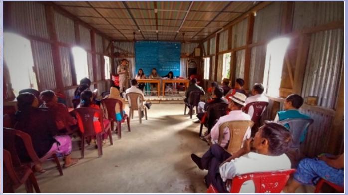
Seleku Village council members at the signing of FPIC on 23 rd March 2023