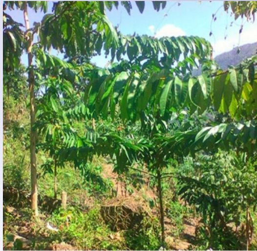
JAF model site at Changtongya New village (Batch-)