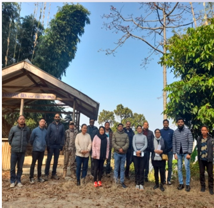
Visit of IUCN members to Terogvunyu Village