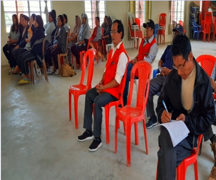
Zisunyu Village council members signing the FPIC