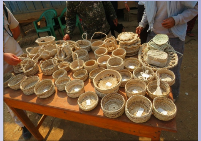
Demonstration on Fibre Extraction at Zhimkiur on 4 th February 2023