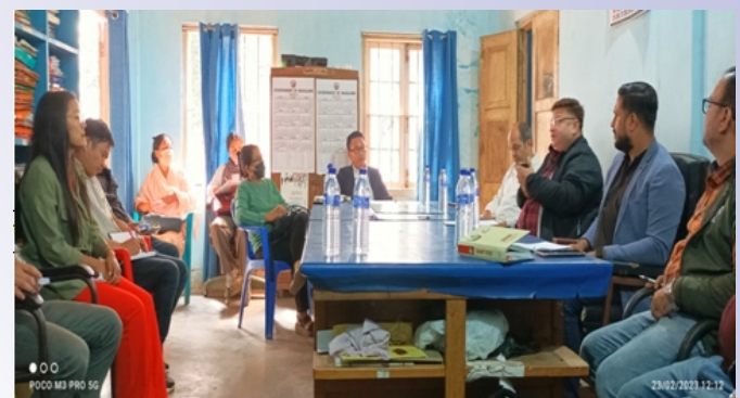
DMU Officials & Staffs with the members of Project Management Consultants at DMU Office Peren on 23 rd Feb 2023.

The PMC members urged the DMU staffs to resolve all the issues and updates regarding MIS on or before 15 th of March, 2023 by coordinating with the PMU staffs.