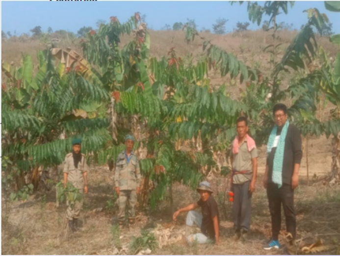
JAF model site at Yaongyimsen village on 26 th Jan. 2023