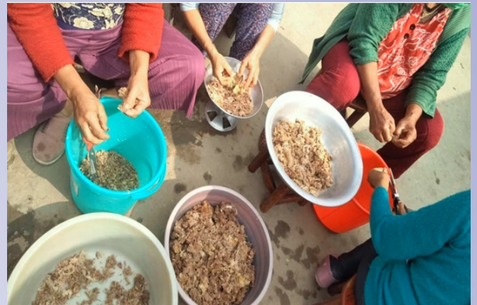
Processing of Beef Pickle by Yanchanchi SHG as a part of Income Generating Activities (IGA)