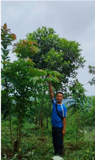
JAF model site at Chi village