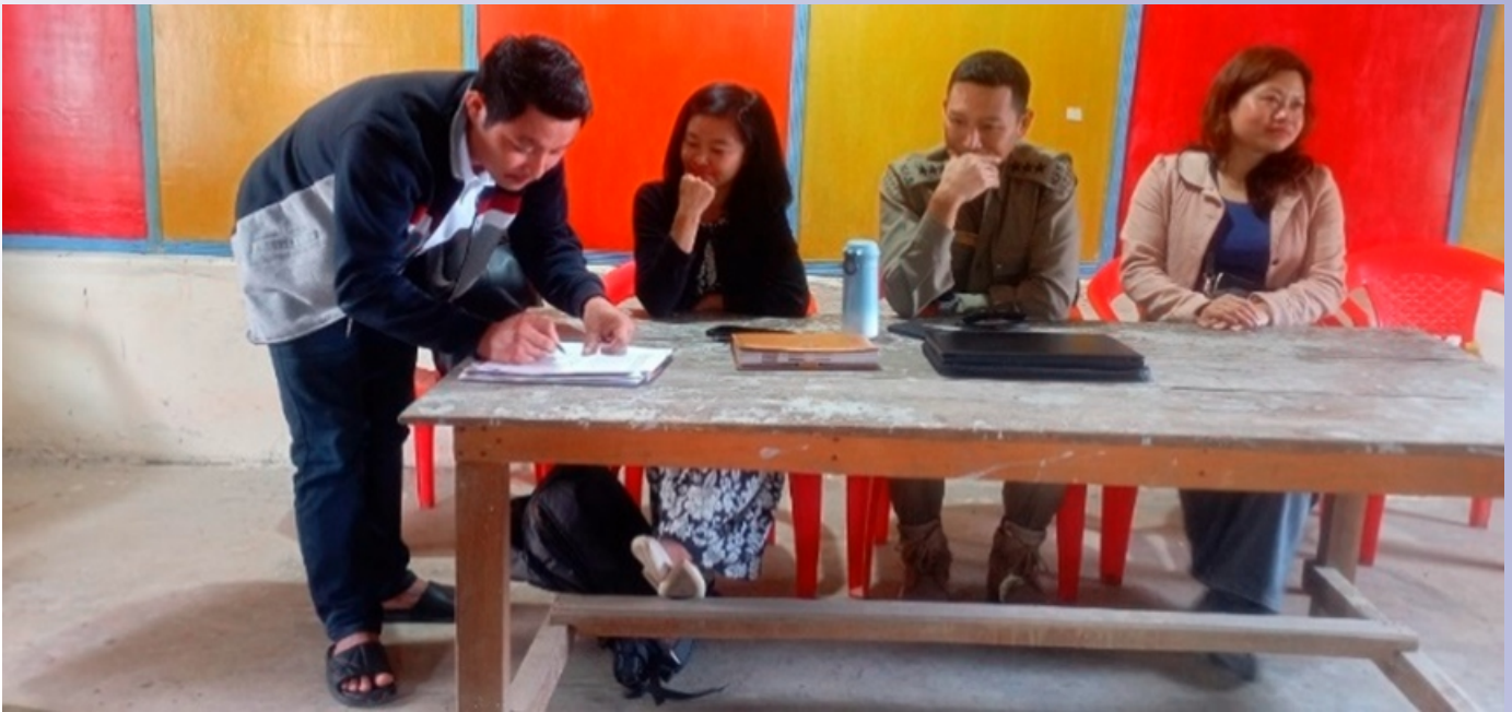
Koio Village Council members at the signing of FPIC on 23 rd March 2023