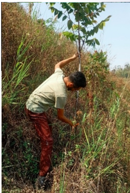
DMU Staff measuring the plant sapling (Bogi poma) at JAF model site New Riphym Village (Batch-I) on 31 st March 2023