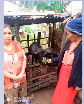
Piggery Unit managed by Nikini SHG at Yesholuto village (Batch-II)