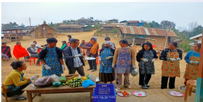
Participants at the "Post-Harvest Management on Fruits & Vegetables" Training in Pokhpur village on 10 th February- 2023