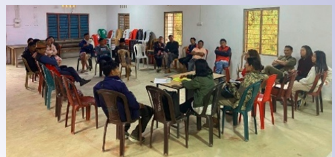
Humtso Village council members at the signing of FPIC on 16 th March 2023