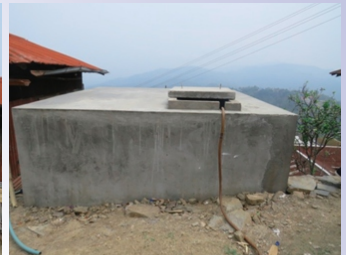
Water Harvesting Structure (WHS) at Chungtia Village