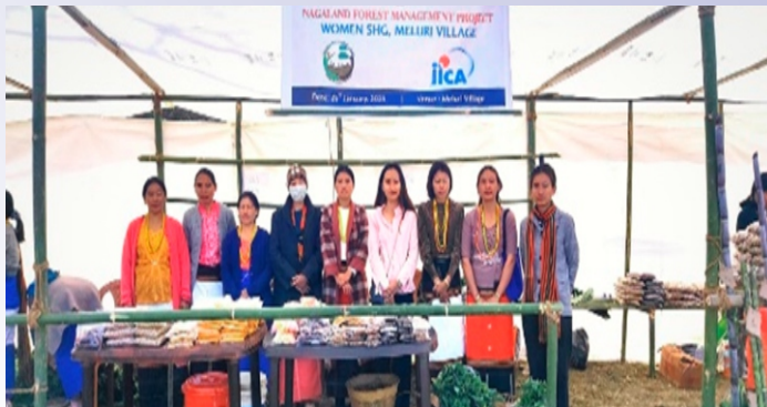
SHG stall at Meluri local ground on the eve of Republic day

includes the produce from their fields and garden as well as local food items prepared by them. Some of the items exhibited at the stalls includes Naga Dal, Carrot, Cabbage, Dried Wild apple, Sticky rice roti, Fried Chips, Kholar, Local turmeric, etc. NFMP is helping the SHGs to showcase & promote their products in various important programmes. For promotion of their products, the SHG's are assisted by DMU support staffs, FMU staffs and FNGOs in every way possible.