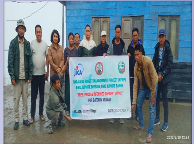
Honito Village council members with officials of DMU Kiphire after signing the FPIC

DMU Kiphire: Meeting for taking Free & Prior Informed Consent (FPIC) was conducted in two villages namely Thsingar village & Langzanger village under Batch-IV on 30 th January 2023 and Nitoi village & Honito village under Batch-IV on 20 th March 2023. The FPIC was carried out by DMU Head Shri. Chisayi, IFS, along with ADMU Head, FMU Head & DMU Support staffs. The purpose of this exercise is to take the consent of the village council members and the village community for implementation of the project.