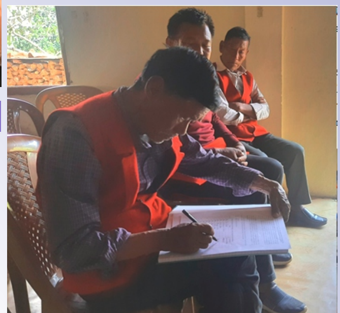
Sishunu Village council members signing the FPIC