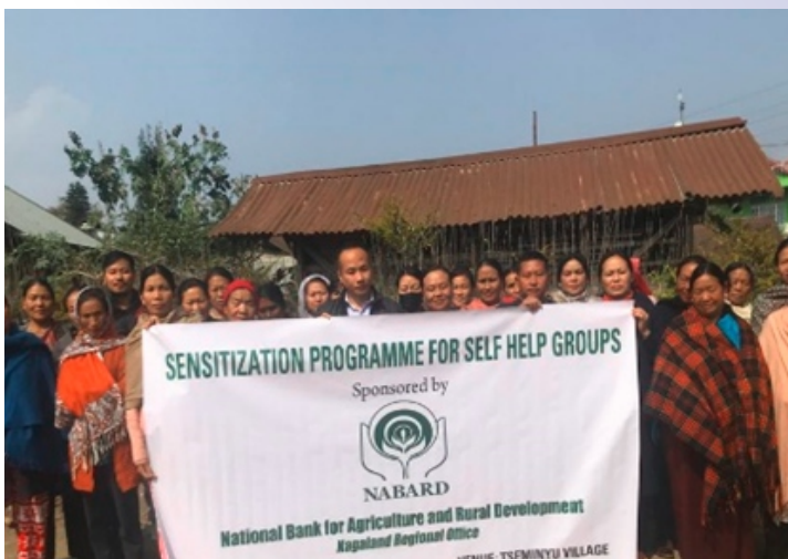
Sensitization programme with SHGs

A sensitization programme with SHGs was held in Tseminyu village (Batch-III) on 11 th February 2023 in collaboration with NABARD. The purpose of the programme was to sensitize the SHGs on financial managements.