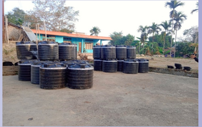
Longpa village EPA – Construction of Agri-Link Road (Complete)