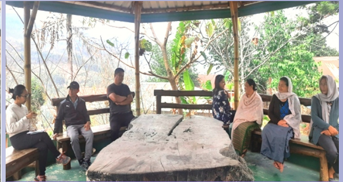
Interaction with JFMC and SHGs members of Tuophema