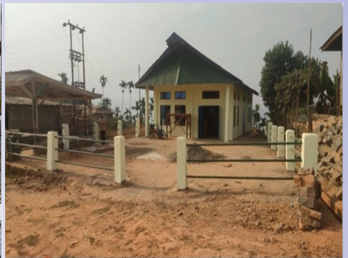
Kelingmen village EPA – Renovation of Community Hall (Completed)