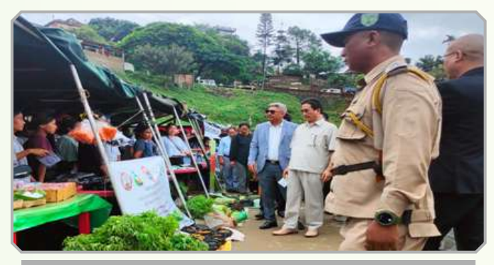
Shri K.G Kenye, Minister of Power & Parliamentary Affairs, GoN visits a stall set up by DMU Mon during the Independence Day celebration on 15<sup>th</sup> Aug 2023 at Mon Local Ground