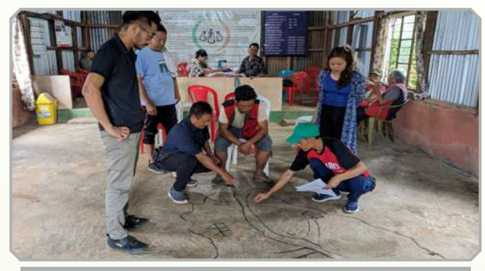
Drawing village social map of Mungya Village