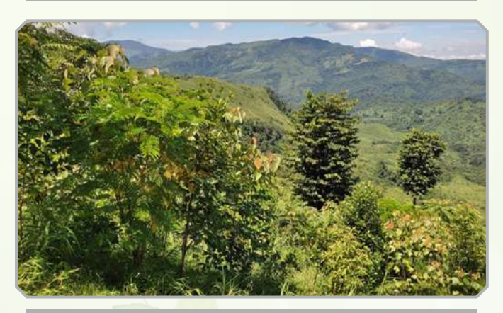
JAF Model Totok Chingnyu (Batch-II)