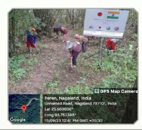
JCC Model Peletkie village