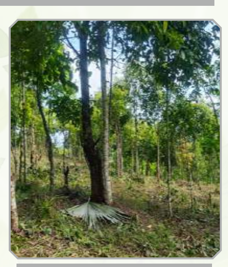
JCC Model Mon village