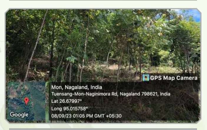
JCF Model Chi JFMC (Batch-II)