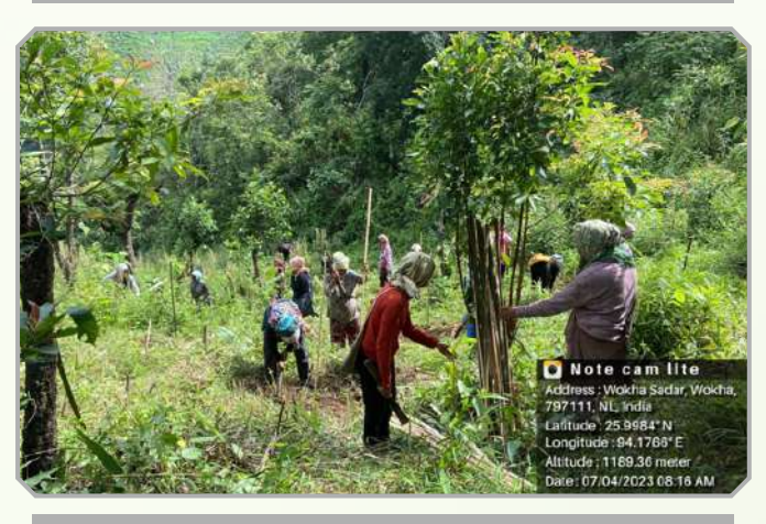
JFF Model Phiro village