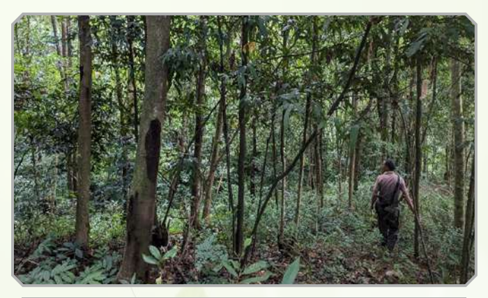
JCF Model Longsa Village