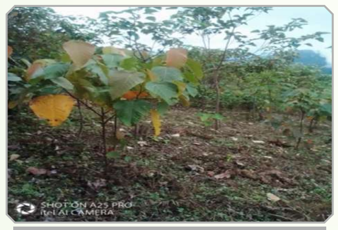
JCF Model Lampong Sheanghah(Batch-II)