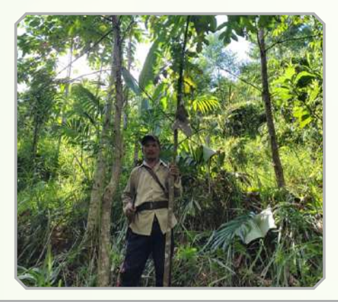
JCF Model Tuimei JFMC (Batch-II)