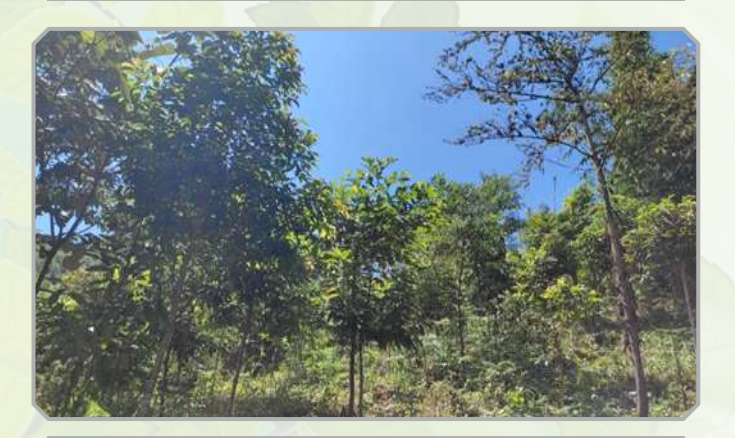
JCF Model Totok Chingnyu (Batch-II)