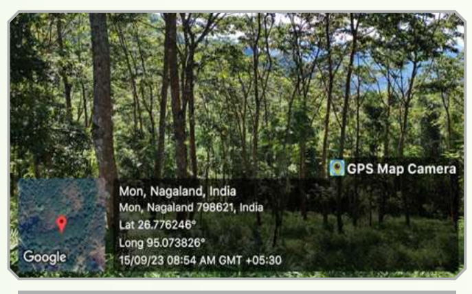
PEC Model Lampong Sheanghah (Batch-II)