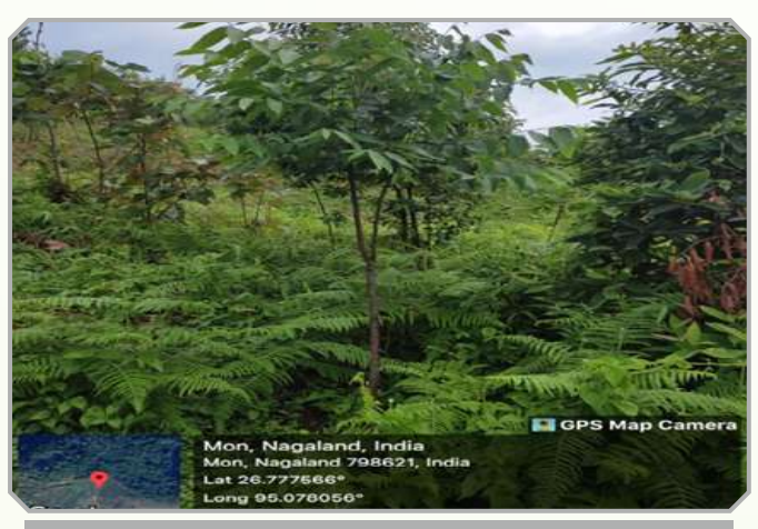
JAF Model Lampong Sheanghah(Batch-II)