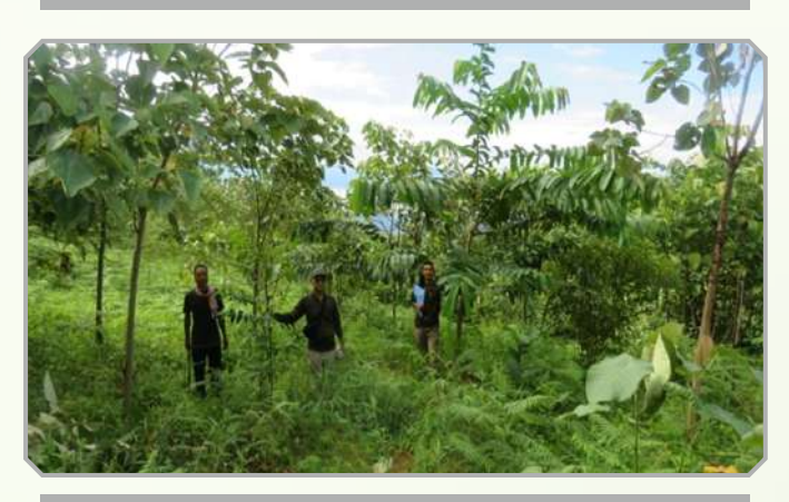
JCC Model Lampong Sheanghah (Batch-II)