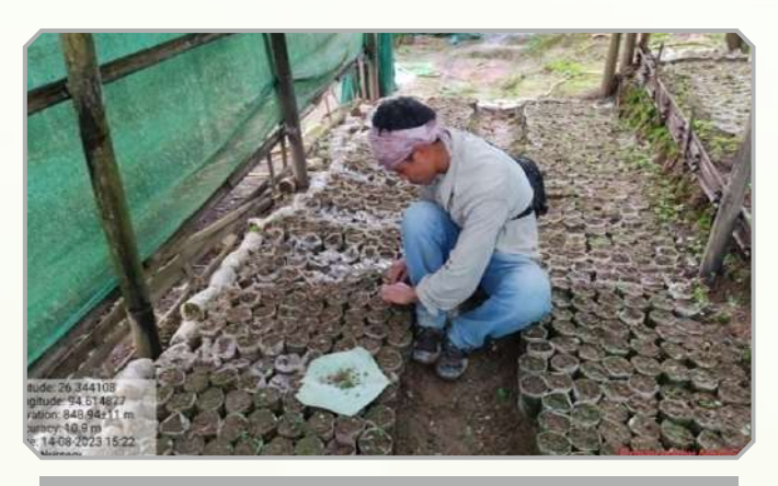
Nursery at Longmisa village