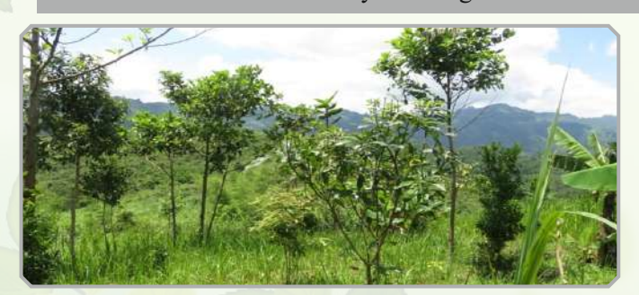
JAF Model at Mongtikang Village.