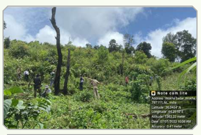
JAF Model Longsa Village