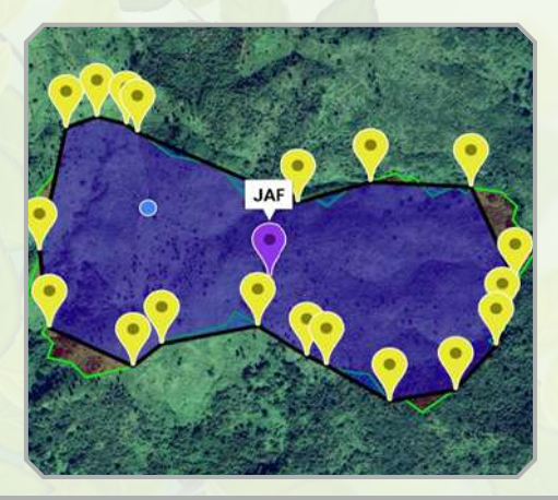
Web GIS map of JAF model Old Riphyim Village