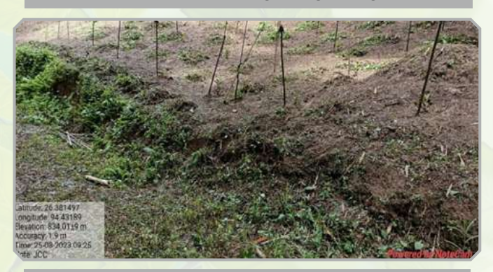
Maintenance Work at JCC Model at Aliba village