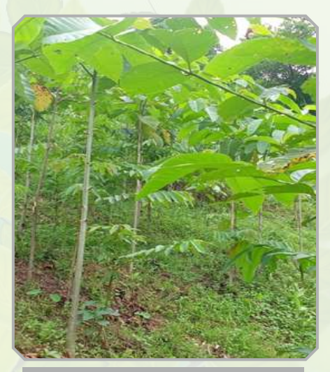
JAF Model Tuimei village