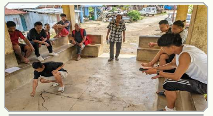
Drawing village social map of Elumyo Village