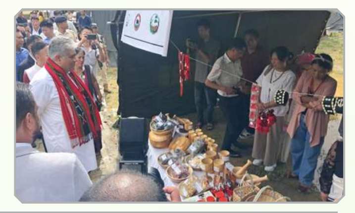
Union Minister Shri. Bhupender Yadav, visiting a stall set up by the SHG's of Jalukie during the inauguration of Public Park cum Botanical Garden on 24<sup>th</sup> August 2023.

Shri. Bhupender Yadav, Hon'ble Minister of Environment, Forest & Climate Change, Labour & Employment, Government of India visited Jalukie, Nagaland on 24<sup>th</sup> August, 2023. He inaugurated the "Public Park cum Botanical Garden" and held meetings with the Joint Forest Management Committee (JFMCs) and Self-Help Groups. He urged the state forest department officials and staffs to work out ways to preserve, protect and enrich the forest and wildlife for the sustainability of biodiversity in Nagaland and gave an assurance that the Central Government would ensure protection of the special provisions of Article-371 (A) of the constitution. The Hon'ble Minister was accompanied by Shri C.L John Minister of Environment, Forest & Climate Change, Govt. of Nagaland and Shri. Y. Kikheto Sema, IAS Commissioner & Secretary, Dept. of Environment, Forest & Climate Change, Shri. Dharmendra Prakash, IFS PCCF & HoFF, and other Officials of Forest Department.