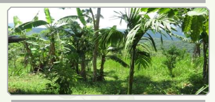
JFF Model at Mongtikang Village.