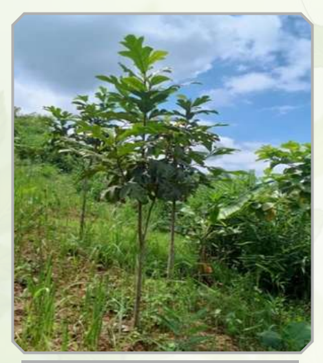
JCF Model TotokChingnyu