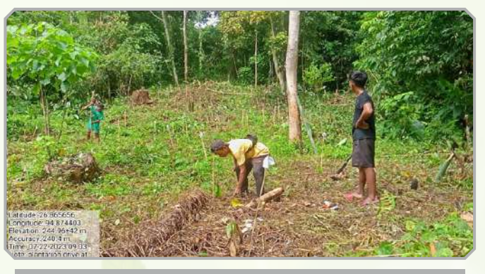
Plantation at PEC Model Upper Tiru village