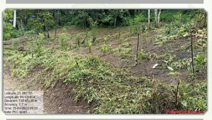
Maintenance Work at PEC Model at Aliba village