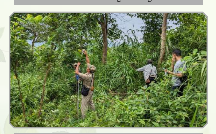
JAF Model Wokha Village