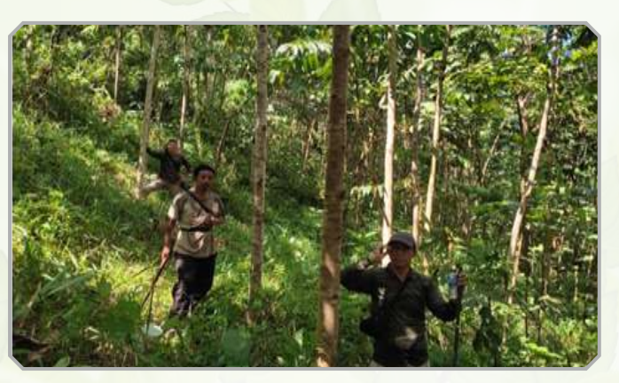
JCF Model Tuimei (Batch-II)