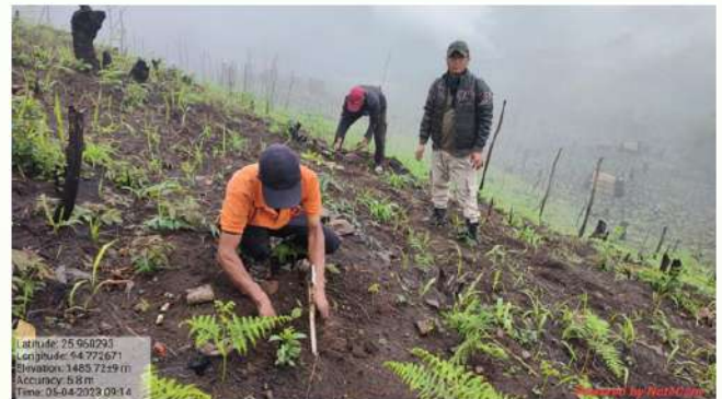
Latitude: 25.9640293 Longitude: 94.7726871 Elevation: 1485.72±9 m Accuracy: 5.8 m Time: 05-04-2023 09:14