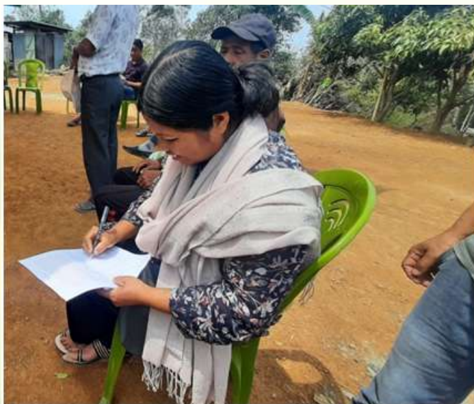
Village members of Gwachonlo signing FPIC