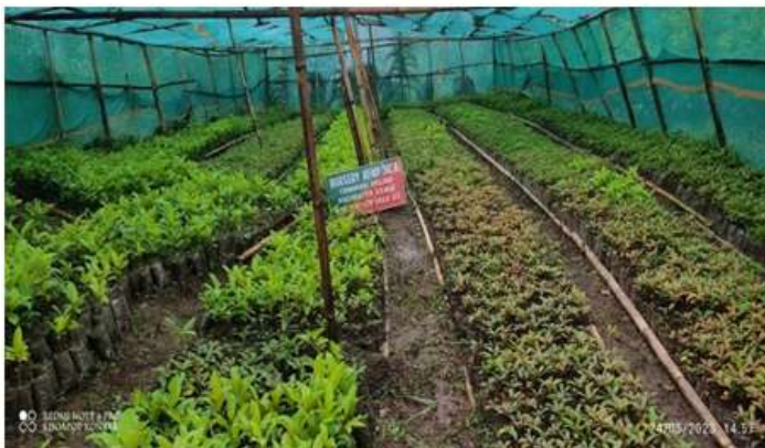
Nursery inspection of JFMC Chingphoi