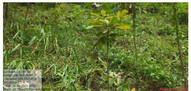
JFF Model Phase II Plantation of Kongan village batch II