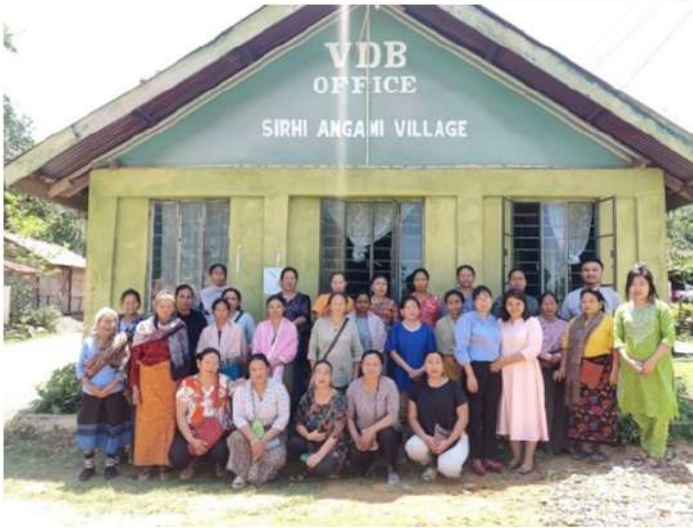
SHG Profiling was conducted and completed at SirhiAngami village, Batch III under Medziphema Beat. A total of 5 SHGs were profiled out of which 3 SHGs shall be selected as the internal stakeholders under NFMP.

Baseline Survey for Batch III villages namely, Sirhi Angami and Ruzaphema Village under MedziphemaBeat was completed during the month of June 2023. During the survey, 24 households and 25 households were conducted at the respective villages using the Kobo app.