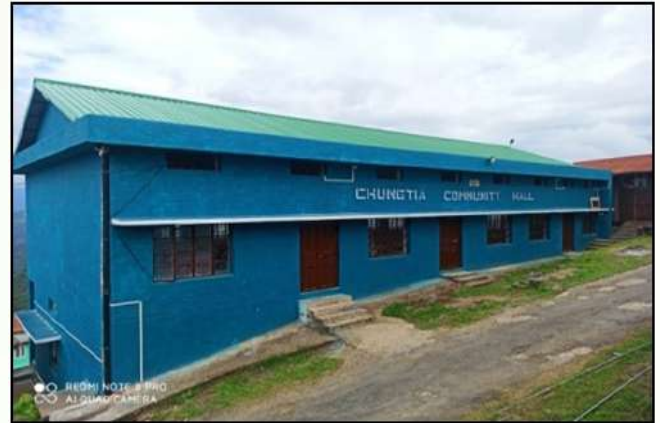
Renovation of Community Hall under EPA was completed. Chungtia