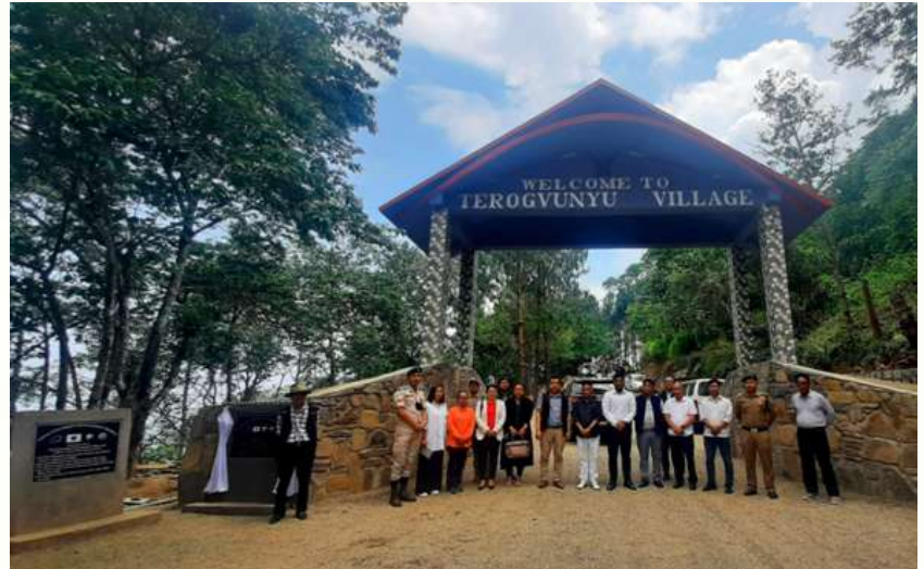
Shri CL John, Minister for Environment, Forest & Climate Change and Village Guards along with officials of the Department during the inauguration