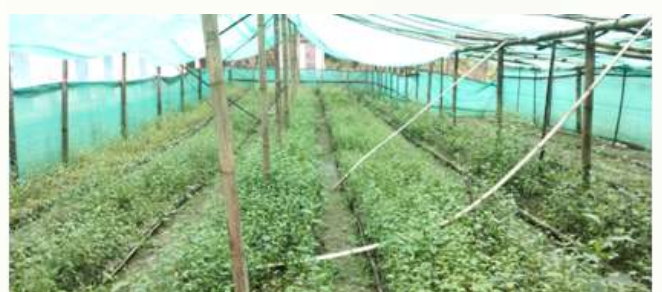
JFMC Nursery, Kisetong village

Kisetong village (Batch-III) nursery. The present stock of over 70,000 saplings comprise mainly of Cherry (80%), Neem, Alder and Pine (about 20%). The saplings have attained maturity for plantation.