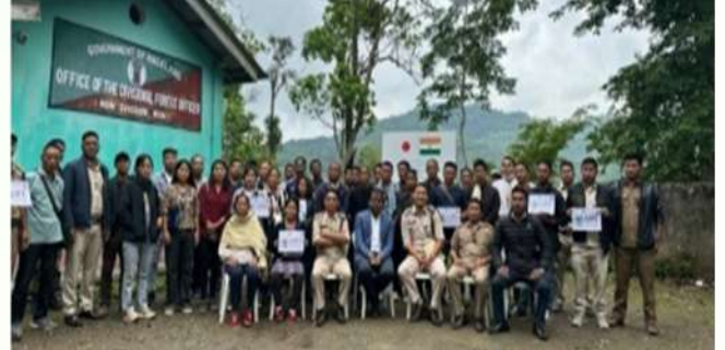
Photo: Annual Review Meeting at DMU Mon

Annual Review Meeting: The Annual Review Meeting was held at DMU Mon, to analyze the achievements and activities under NFMP Mon division. JFMC representatives of Batch I, II, & III, FNGO, FMU, ADMU and DMU staff attended the meeting which was chaired by DMU Head. The FNGOs, FMUs showcased their activities and accomplishments over the course of 2022-2023.