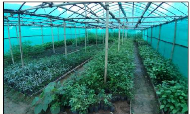
Chungtia village Nursery