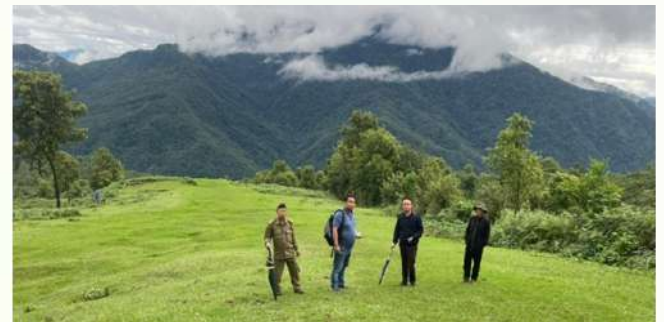
Old Poilwa Village