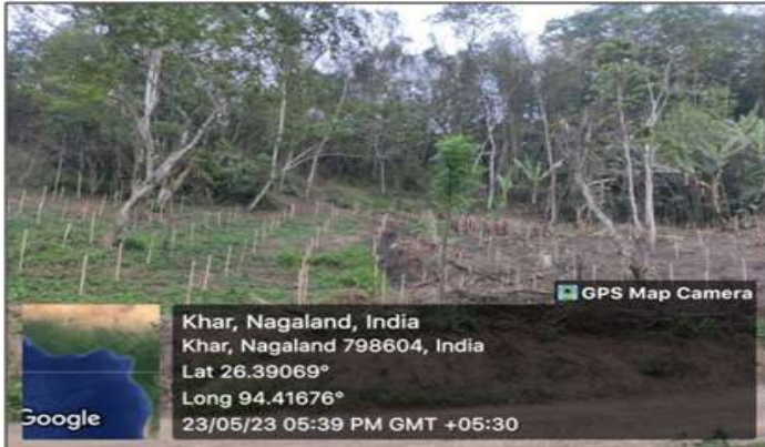
Advance work: Clearing, staking & pit digging in JCC Model