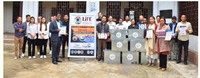
FNGOs and DMU officials of all the Northern Territorial Circle (NTC) after the meeting.

The meeting was attended by all the FNGOs and DMU officials of all the Northern Territorial Circle (NTC).