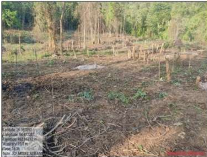
Advance work: Clearing, staking & pit digging in JCF Model