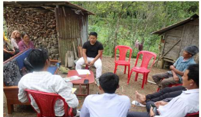
Meeting with Micro planning working bodies in Sishunyu Villages