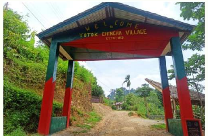
EPA of Totok Chingha village Batch III