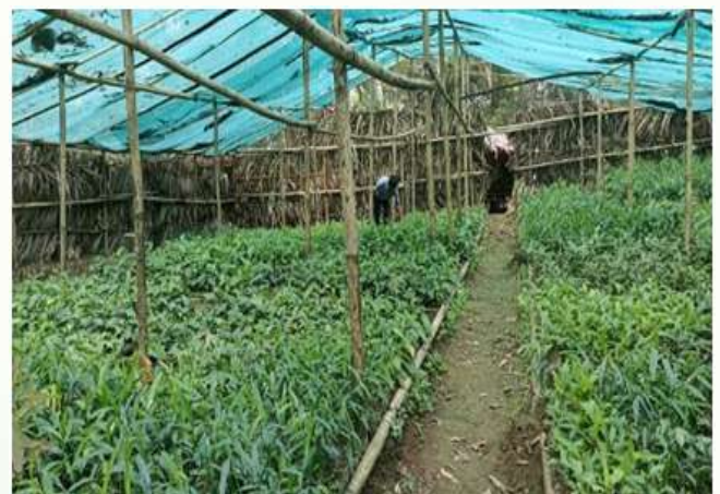
Nursery of Tanhai Village Batch II