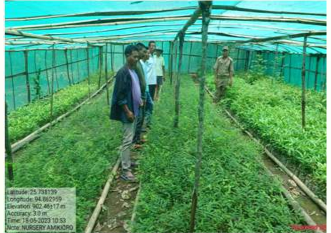
EPA & WHS works and saplings in JFMC Nursery at Amikioro