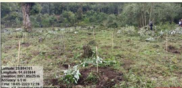
Latitude: 25.894761 Longitude: 94.653944 Elevation: 2051.85±25 m Accuracy: 6.5 m Time: 18-05-2023 12:28 Note: JCF Plantation site Sevachuan (B34-144)

On 18 th May 2023, DMU support staffs visited the JCF Model Plantation area. The plantation activities were scrutinized and supervised by the visiting team. The total area under JCF model was 9 Ha.