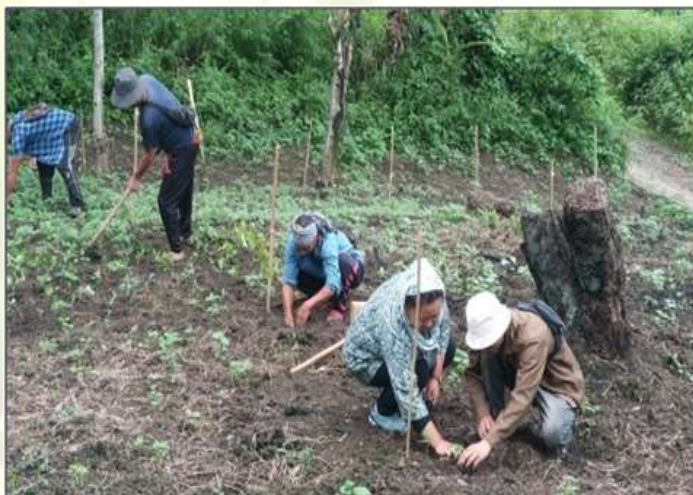
Plantation activity at PEC Model Chungtia Village