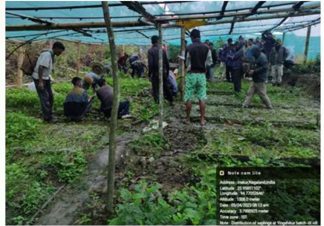
Note: cam site Address: Inakshingiang, India Latitude: 25.9981102 Longitude: 94.7202640 Altitude: 1388.0 meter Date: 05/04/2023 09:13 am Accuracy: 3.709063 meter Time zone: IST Note: Distribution of saplings at Yingshikiur batch-III

On 18 th May' 2023, DMU Official and staffs visited Yingshikiur village to supervise the plantation works in JAF treatment model. During the day long plantation, altogether 22,100 saplings were planted. The species planted on that day includes Bonsum, Alder, Pine, Silver Oak and Khokon.