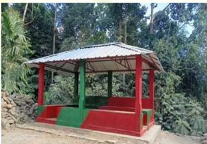
Tanhai batch II

Annual Review Meeting: The Annual Review Meeting was held at DMU Mon, to analyze the achievements and activities under NFMP Mon division. JFMC representatives of Batch I, II, & III, FNGO, FMU, ADMU and DMU staff attended the meeting which was chaired by DMU Head. The FNGOs, FMUs showcased their activities and accomplishments over the course of 2022-2023.