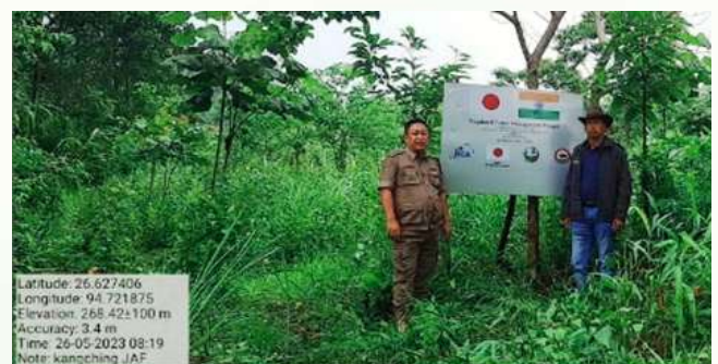
Latitude: 26.627406 Longitude: 94.721875 Elevation: 268.42±100 m Accuracy: 3.4 m Time: 26-05-2023 08:19 Note: kangching JAF

The team engaged in interactions with the beneficiaries and JFMC Members regarding plantation and functioning of its activities. Upon return, the team visited JFF area of Hukphang village for site inspection.