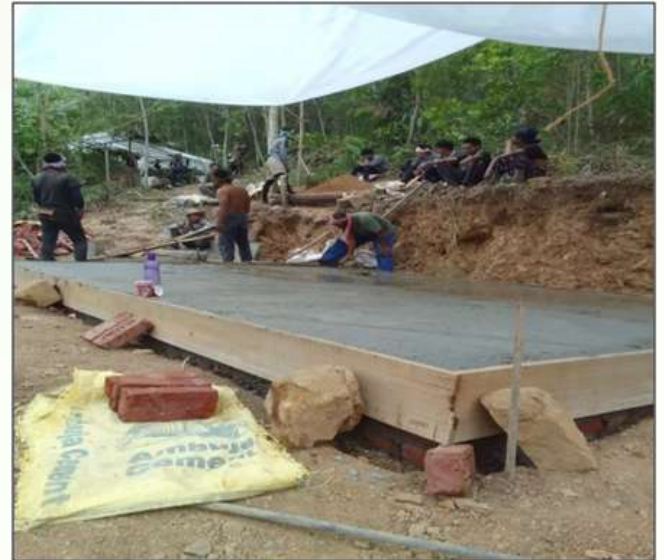
WHS activity Chungtia village