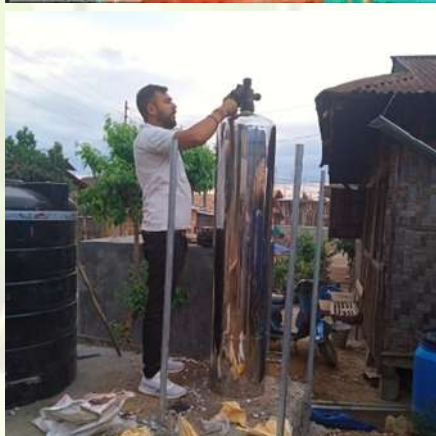
Technician installing the water filtration plant at Yachem Village.