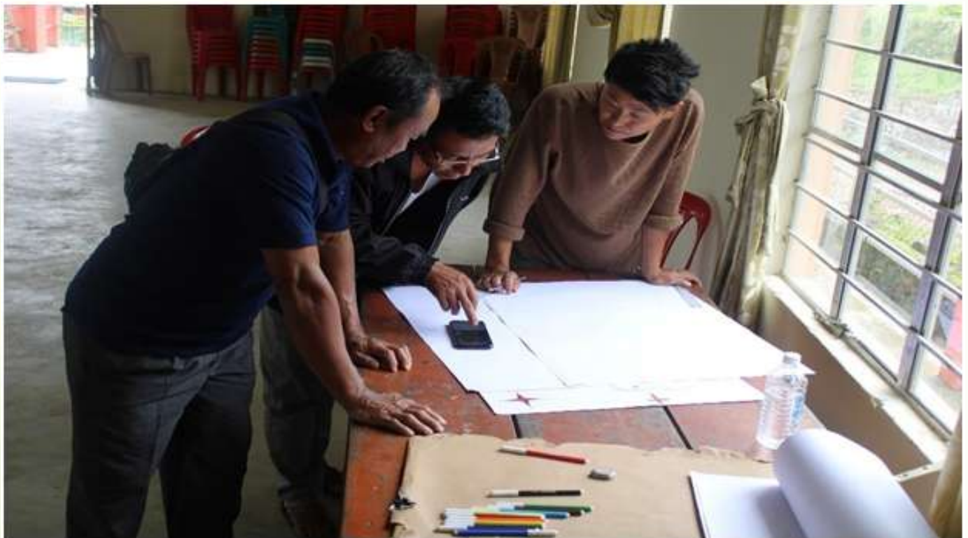
Resources Mapping under PRA exercise in Zisunyu village