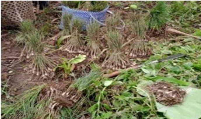
Naga garlic harvested by Phezou SHG members from Piphema Old Village, Batch II under Piphema Beat, as part of their Income Generating Activity

On 6 th May 2023, DMU Kiphire support staffs visited Yinshikiur village to supervise and coordinate SHG profiling activity initiated for the Batch III Village. Altogether, 7 (seven) SHGs were profiled in coordination with FNGO in the presence of JFMC members.