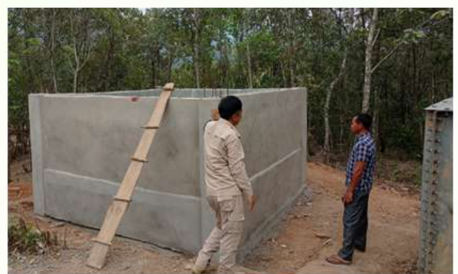
WHS at Azetso village (Batch-III)

On 17 th May' 2023, DMU officials and support staff visited Azetso village (Batch-III). During the visit, the officials inspected the construction site of WHS. The dimension of the water storage tank constructed are 12' x 12' x 7' with a storage capacity of 28,300 litres. The JFMC was tasked with installing roofing for the tank and to insert a marble stone name plate upon completion.