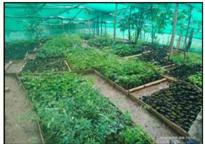
Aliba village Nursery