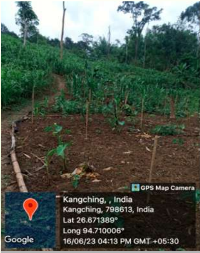
JFMC members of Yachem Village before the Plantation at JAF-1 Area

The plantation and maintenance work at Kangching Village JAF area was done on 16 th June 2023 by JFMC members.