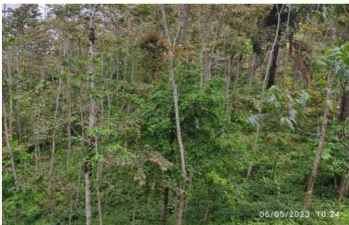
JCF Model of JFMC Wakching Batch II