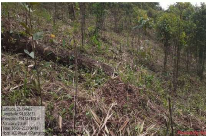
JCC Model Phase II Plantation of Kongan Village Batch II