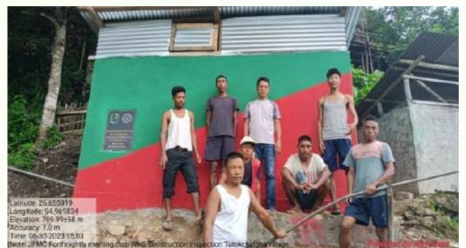
WHS of Totok Chingha Village Batch III