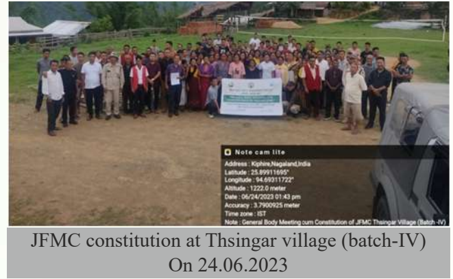
JFMC constitution at Thsingar village (batch-IV) On 24.06.2023