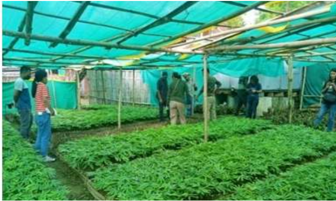
Pongkong Batch III Nursery