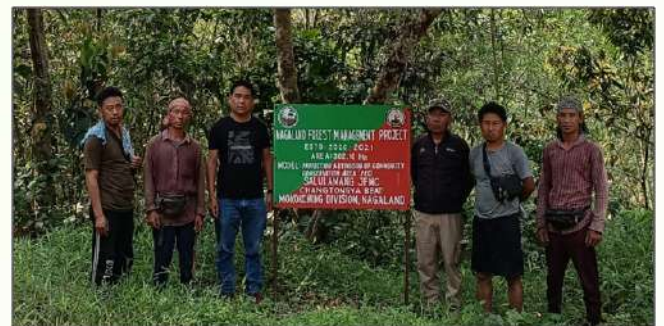
Survey team for Mobile App GIS Data entry