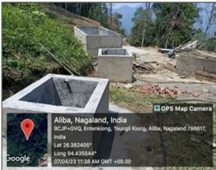
EPA-cum-WHS activity, Aliba