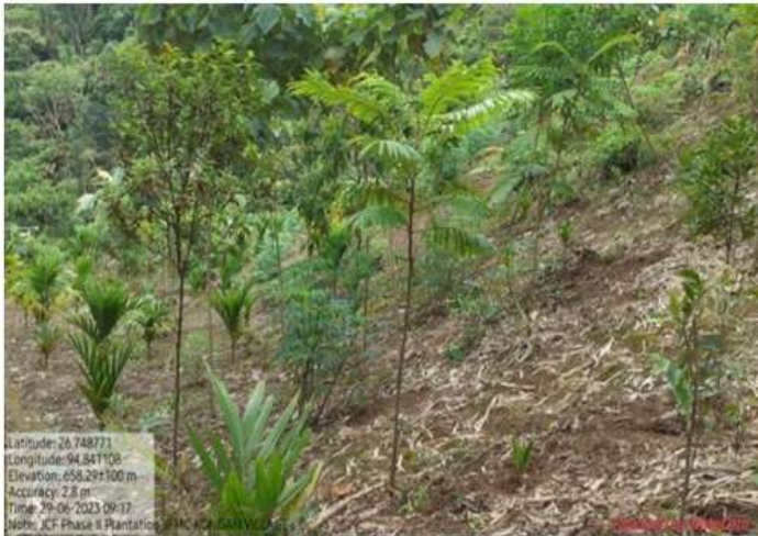
JCF Model Phase II Plantation of Kongan Village