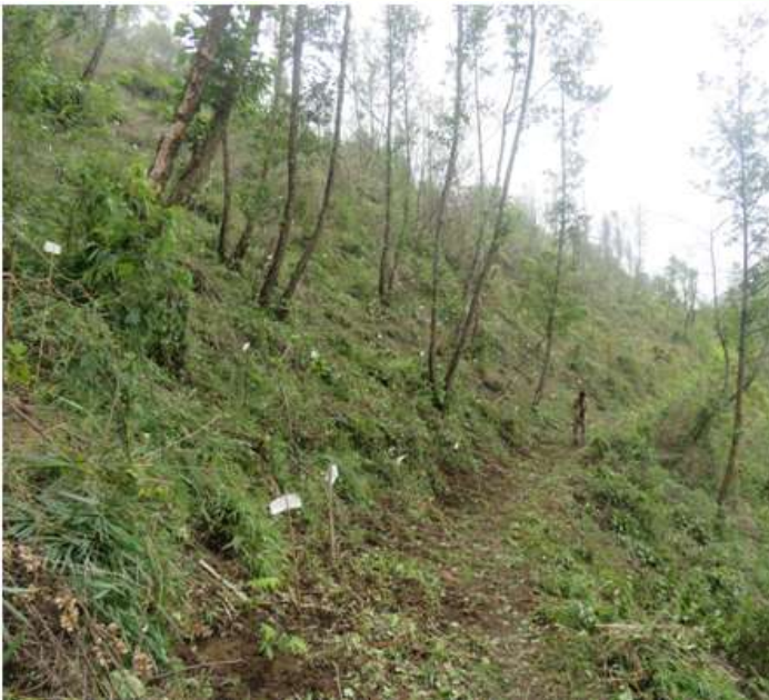
Plantation works in PEC model Treatment area at Old Risethsi village

On 18 th May 2023 DMU support staffs visited Amikioro village (Batch-III) to examine the activities completed under EPA and WHS. During the visit, the status of saplings in the nursery and follow-up plantation work scheduled for June, 2023 was discussed with the JFMC.