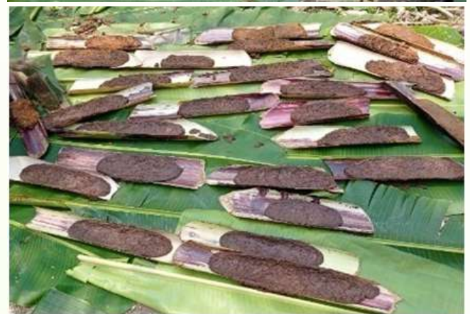
Manufacture of Jaggery was undertaken by Myanta SHG of Longsachung Village (20kg of jaggery was processed)

PMC visits: The PMC Team led by Shri. Pranab Chaudary, Team Leader visited New Riphym village on 5 th May 2023 to inspect the progress of Forestry Intervention and Livelihood for the forthcoming midterm annual assessment by JICA-India. The team examined a sample plot to estimate the survival rate of the natural regeneration and planted saplings in JAF site. After engaging in discussions, the DMU and FMU staff were tasked with producing a report on the Soil and Water Conservation initiatives and conclusions undertaken under Forestry Intervention in Yikhum Village (Batch-III). PMC team apprised the concerned officials to ensure the updation of registers and record keeping of all JFMC and SHGs.