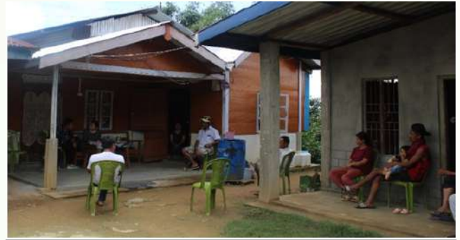
Meeting with Micro planning working bodies in Gwachonlo Village

Participatory Rural Appraisal Exercise with Micro Plan working bodies was conducted in Batch – IV villages of Zisunyu Sishunyu and Gwachonlo villages on, 20 th , 22 nd and 26 th June 2023 respectively. During the exercise, the village members were given an overview of their roles, responsibilities, and the primary objectives of the NFMP.