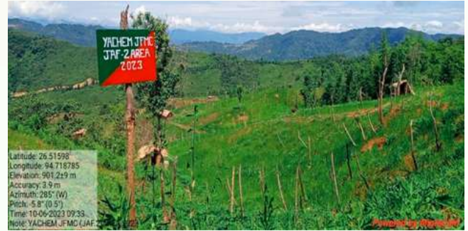
Plantation at JAF-2 Area in Yachem Village