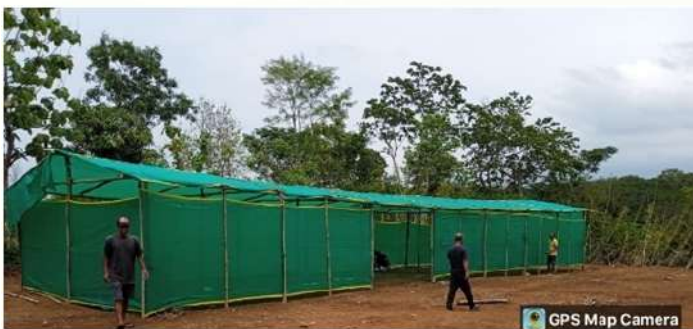
Nursery constructed at Ruzaphema Village, Batch III under Medziphema Beat. The nursery structure measures 70M in Length and 18M in Breadth.