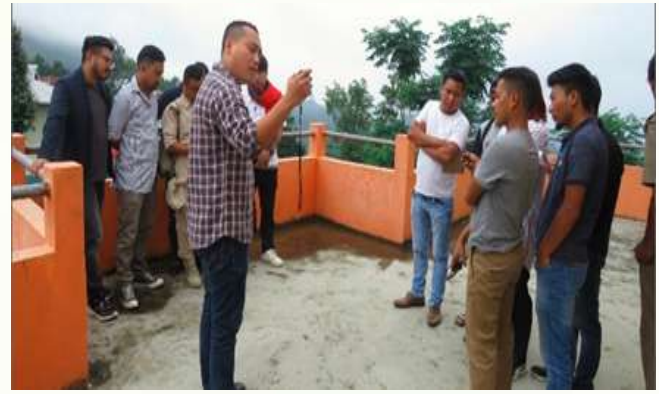
During the Training at DMU Office Longleng.

Amritsarovar general public awareness campaign was done on first week of April, 2023 at Yaongyimsen, Merangkong, Salulamang and Kelingmen. Forest staff, FNGO, SHG along with some Watsu (Women) group participated in this campaign.